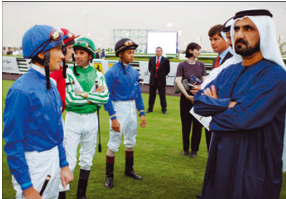
WAM & Al Bayan